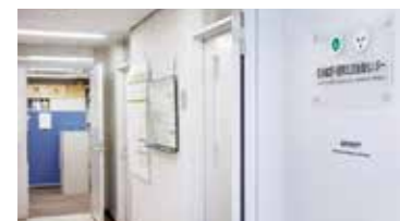
International Relations Division

As of April 2023, 62 international students from 10 countries study at the Graduate School of Medicine. Staff members of the International Relations Division are responsible for creating a comfortable environment for international students, and provide academic and personal support.