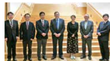
A Visit from The University of Melbourne (Australia)

Our mission is to increase the presence of the Graduate School of Medicine on the international scene. We promote partnerships with institutes and faculties overseas, share the latest technologies and knowledge, and provide students with quality education that meets the needs of diverse and global society.