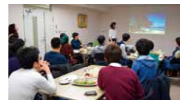
Events to interact with international students

We also strive to nurture responsible global citizens and leaders for the future. We host seminars and events designed to help students acquire practical knowledge in medicine and research, as well as manners and communication skills useful in the global society.