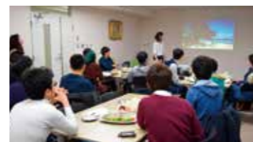
Events to interact with international students

We also strive to nurture responsible global citizens and leaders for the future. We host seminars and events designed to help students acquire practical knowledge in medicine and research, as well as manners and communication skills useful in the global society.