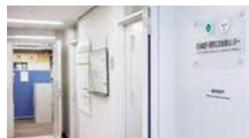
International Relations Division

As of April 2022, 46 international students from 8 countries study at the Graduate School of Medicine. Staff members of the International Relations Division are responsible for creating a comfortable environment for international students, and provide academic and personal support.