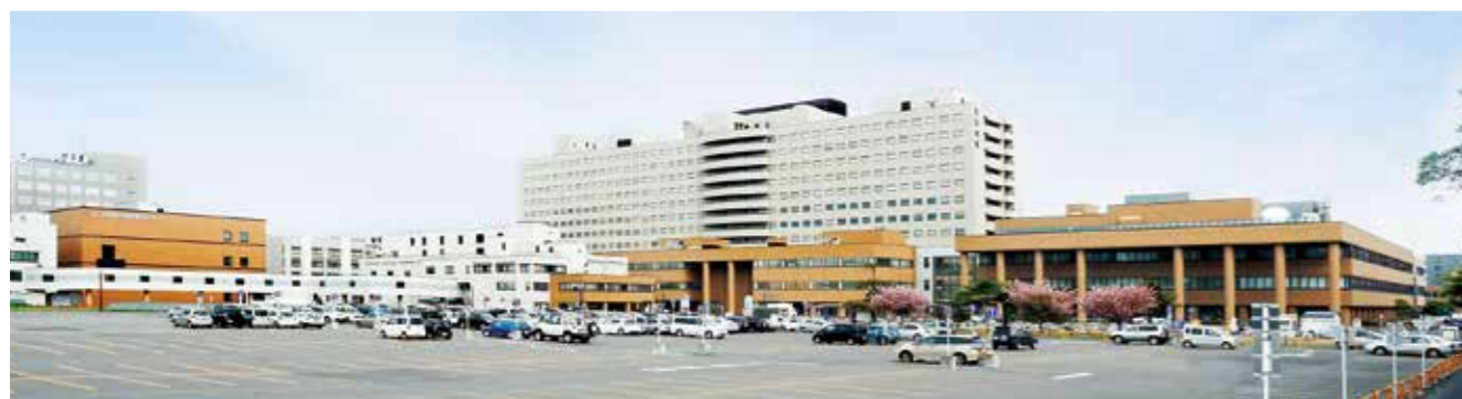
Hokkaido University Hospital

★ Example of doctoral program started in the final year of the training of medical specialist