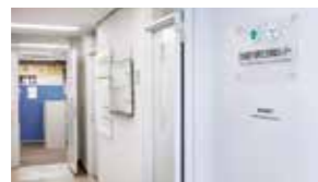
International Relations Division

International Relations Division Supports International Students As of April 2022, 46 international students from 8 countries study at the Graduate School of Medicine. Staff members of International Relations Division are responsible for creating a comfortable environment for international students, and provide academic and personal supports.