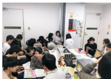
International Federation of Medical Student Association