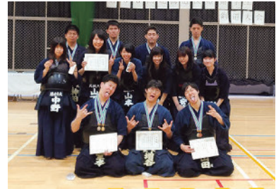
Kendo (Japanese Fencing)