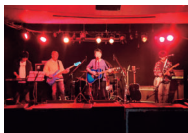
The Band Club of Hokkaido University School of Medicine