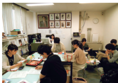
"Frate" Editorial Office