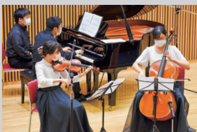
Presentations of activities by current students