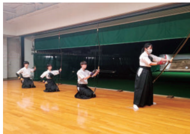
Kyudo (Japanese Archery)