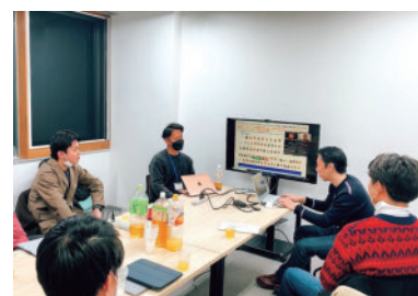
Medical North Initiative