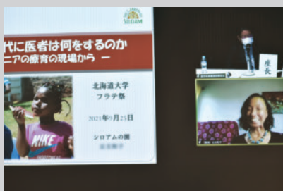
Special Lectures by Alumni

Held online in 2021,2022 due to the COVID-19 pandemic