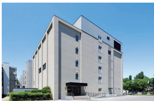
Institute for Animal Experimentation

For details, see https://www.med.hokudai.ac.jp/en/general/history.html