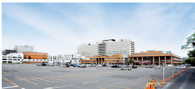
Hokkaido University Hospital