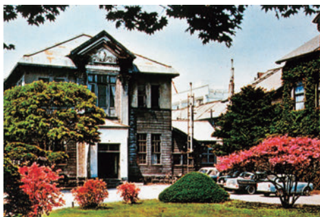
Old Main Building of the School of Medicine